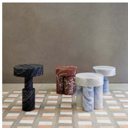
LONDON TIME Above: Self-Portrait's debut boutique. Below: Hide's airy space. Below left: A display at Agnona.