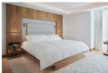
ENGLISH ACCENTS Above: A bedroom in the Mews, the Connaught hotel's private townhouse. Right: The bar at Isabel. Below: The new MatchesFashion.com store.